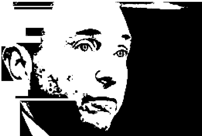
NHL commissioner Gary Bettman.