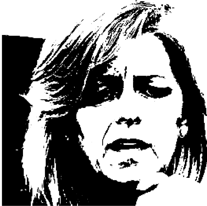
9 Stacey Allaster, WTA commissioner.