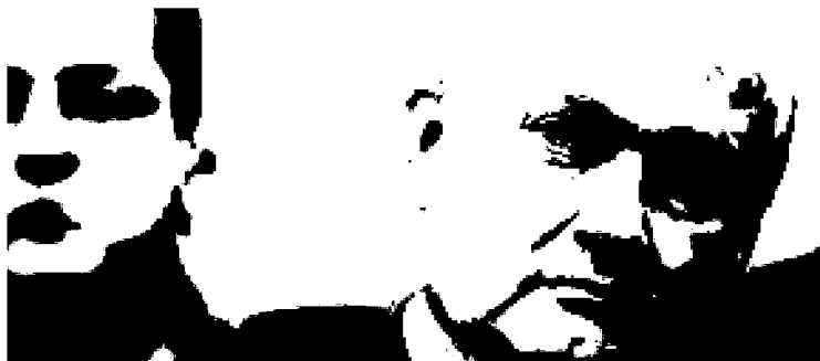
2 Donald Fehr, NHLPA executive director.