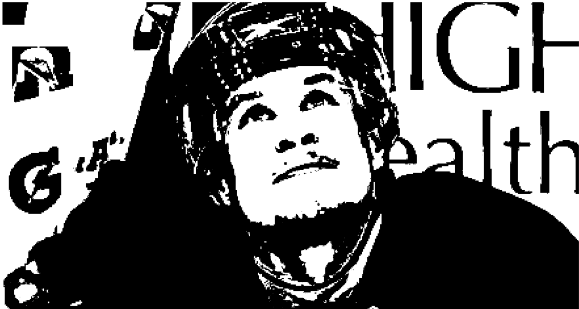
4 The Pittsburgh Penguins' Sidney Crosby is in a position to lead.