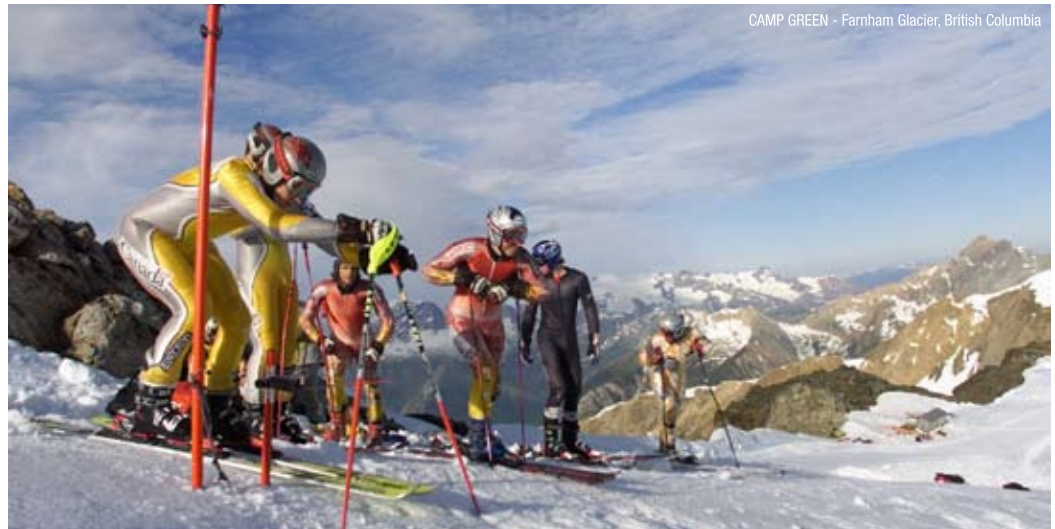
CAMP GREEN - Farnham Glacier, British Columbia

During the 2008-2009 winter season, WinSport Canada facilities hosted 48 provincial, national and World Cup sporting events along with 25 other sport events ranging from grassroots for kids and youth to the Burton Canadian Open.